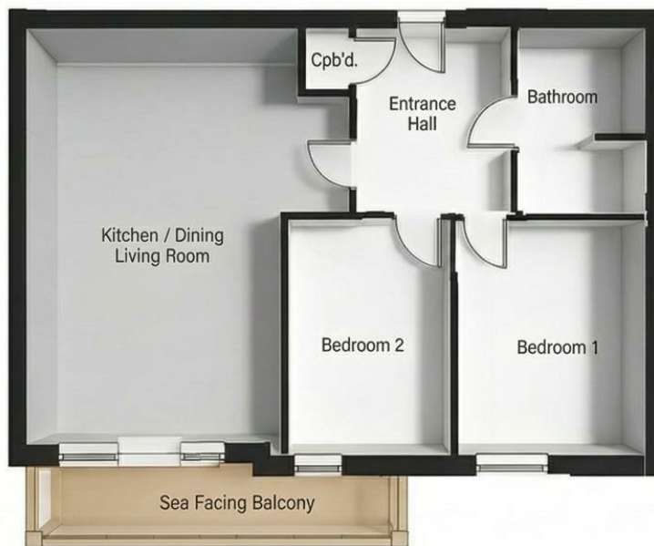
Flat 4, 41 Central Parade, Herne Bay